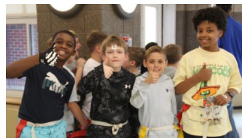
Left: Four elementary students smile for a photo as they prepare to go outside for a game of flag football.

*Based on the proposed 5.8% tax levy increase. Figures are estimates and subject to change based on STAR exemptions, changes in assessed and full values, and equalization rates.