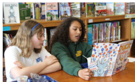
Right: Two elementary students read together as part of the Hudson Reads program.